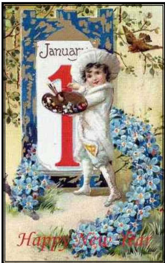
Best of Wishes for 2004!