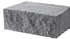
Flat Face 6" x 16" x 12" 15.2 cm x 40.6 cm x 30.5 cm (also available w/tapered sides)