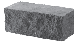
Corner Unit 6" x 16" x 8" 15.2 cm x 40.6 cm x 20.3 cm