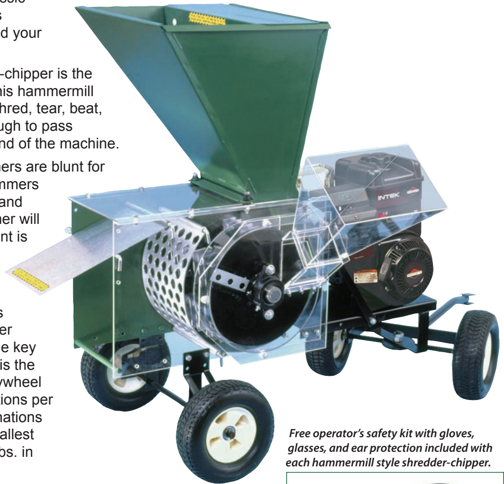
Free operator's safety kit with gloves, glasses, and ear protection included with each hammermill style shredder-chipper.

Another outstanding feature of our hammermill machines is the centrifugal clutch. It is designed for easy no-load starting while offering operator and engine protection not available with a direct drive machine. The clutch will also disengage if the machine is overloaded. This allows the engine, flywheel, and rotor RPM's to quickly recover to full speed and complete the task at hand. With five sizes to choose from, MacKissic offers the right hammermill shredder-chipper to satisfy your needs.