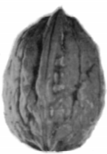
Spurgeon walnuts (natural size)