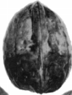
Franquette walnuts (natural size)